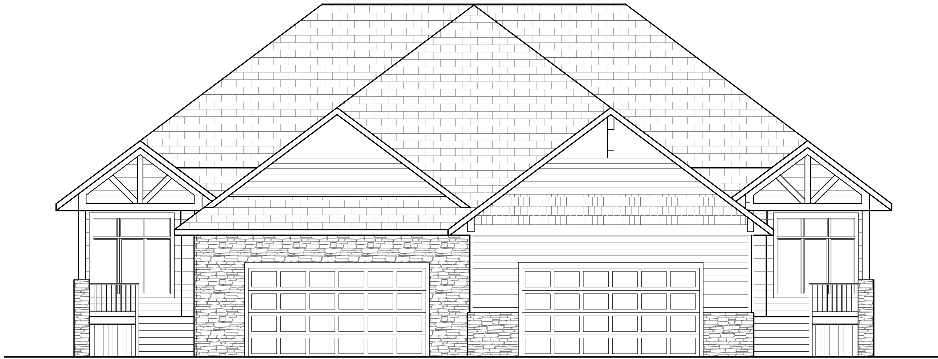
FRONT ELEVATION - BUNGALOW B