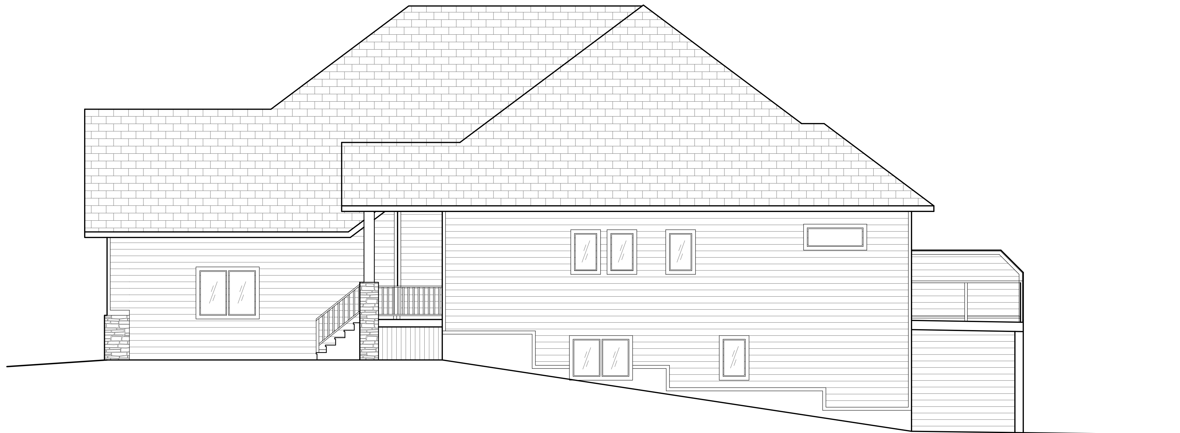
SIDE ELEVATION- BUNGALOW B